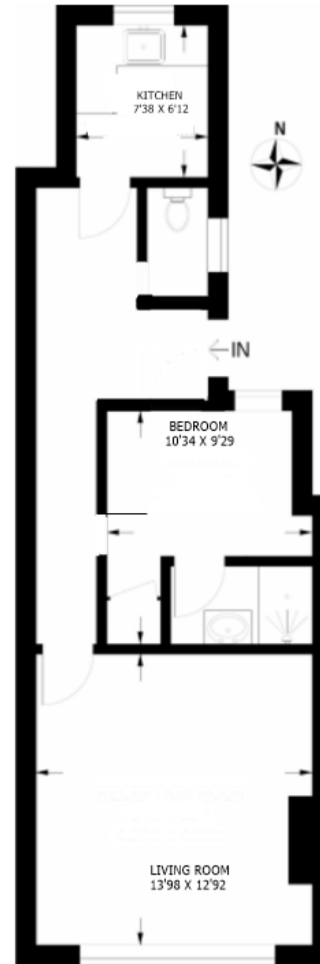
SECOND FLOOR 484 SQ FT / 45.0 SQ M

We have prepared these property particulars as a general guide to a broad description of the property. They are not intended to constitute part of an offer or contract. We have not carried out a structural survey and the services, appliances and specific fittings have not been tested. All photographs, measurements, floorplans and distances referred to are given as a guide only and should not be relied upon for the purchase of carpets or any other fixtures or fittings. Lease details, service charges and ground rent (where applicable) and council tax are given as a guide only and should be checked and confirmed by your Solicitor prior to exchange of contracts. The copyright of all details, photographs and floorplans remain exclusive to Estateology.